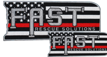
FAST Flag Thin Red Line Patch