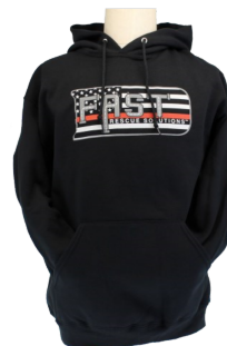
FAST Thin Red Line Hoodie S-2XL