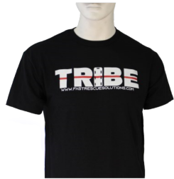
TRIBE Logo T-Shirt S-2XL