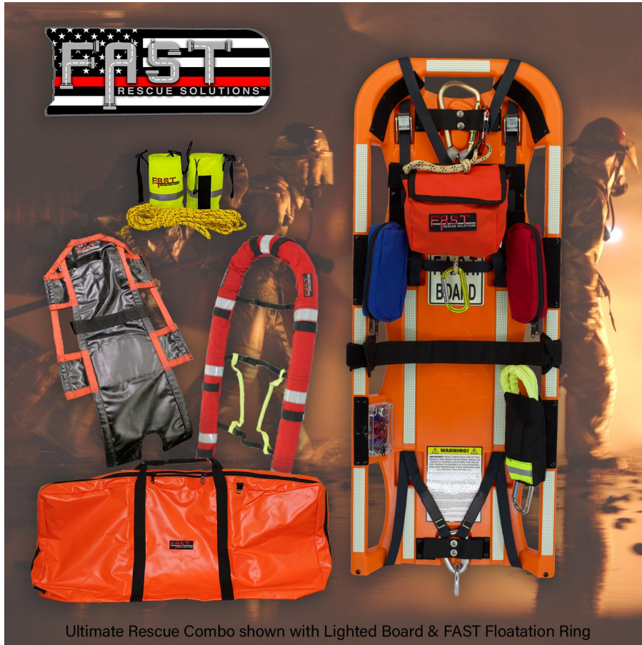
Ultimate Rescue Combo shown with Lighted Board & FAST Floatation Ring