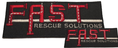
FAST Logo Patch