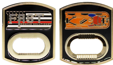
FRS Challenge Coin/Bottle Opener