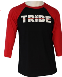
TRIBE 3/4 Sleeve Baseball Jersey S-2XL