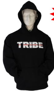
TRIBE Logo Hoodie S-2XL