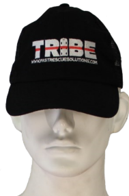
TRIBE Logo Ball Cap