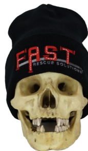
FAST Logo Beanie

Please contact sales@fastrescuesolutions to place an order or receive a quote www.FASTRescueSolutions.com