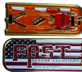
FAST Board Challenge Coin