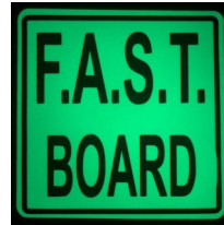
FAST Board AWOGS Decal