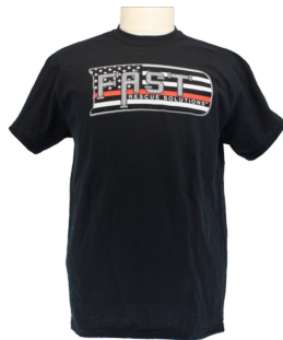
FAST Thin Red Line T-Shirt S-2XL